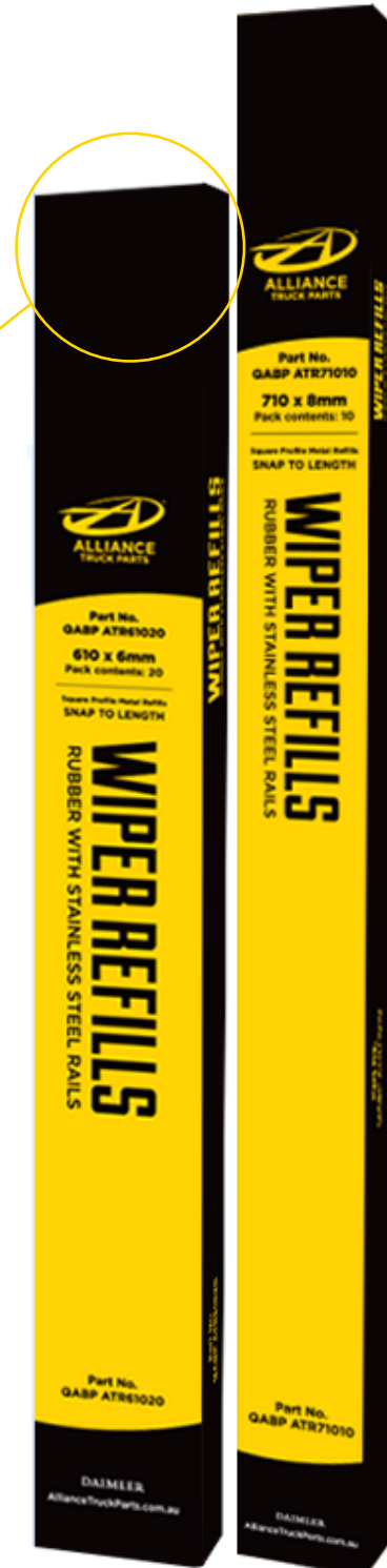
Illustration and photographs used in this catalogue may vary slightly from the actual product. Prototype samples are sometimes for photography. The production parts may vary slightly. Availability of products shown in this catalogue is subject to change without notice. Alliance Truck Parts is a registered trademark of Daimler Trucks North America LLC.